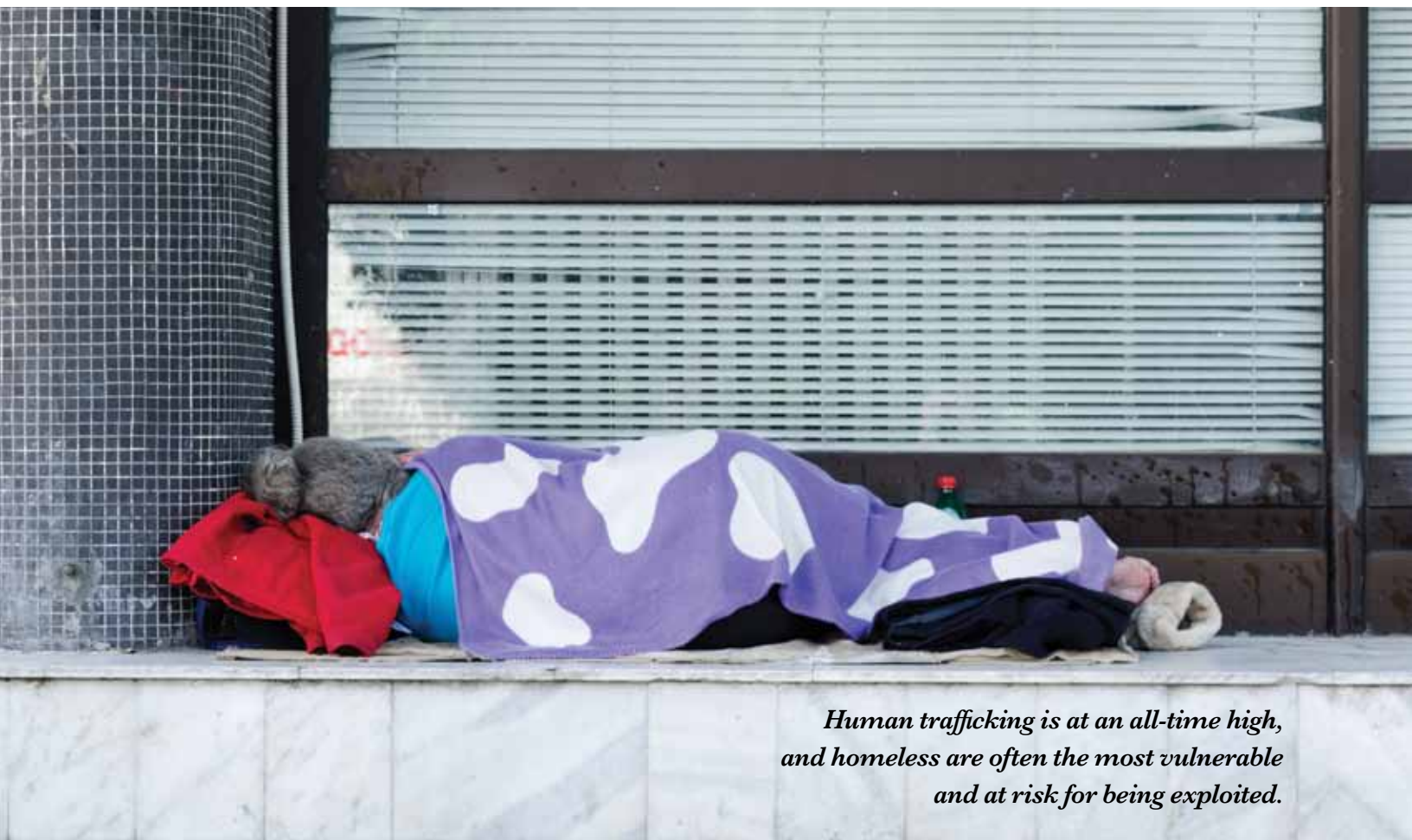
Human trafficking is at an all-time high, and homeless are often the most vulnerable and at risk for being exploited.

Our hearts hurt for every victim and person in survival mode who comes to us for help – that chance to feed, encourage and help them get a new start may be the only